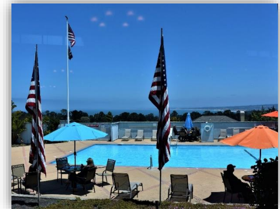
The Lodge swimming pool with a view of Monterey Bay

A stage to accommodate a band is available along with a large dance floor. Podium, microphone, and drop-down screen are also available. Projector is not included.