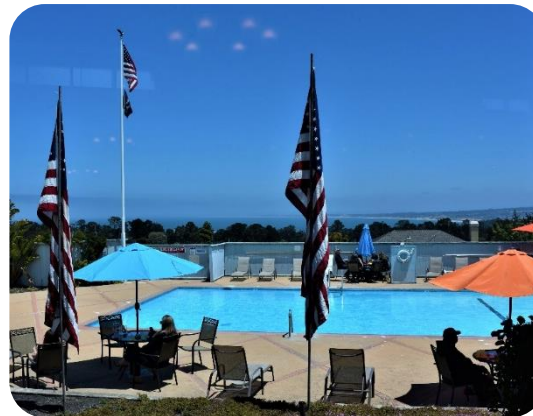
The Lodge swimming pool with a view of Monterey Bay